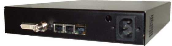
VCX-6400-D Rear View